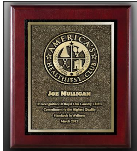
America's Healthiest Club – Cherry Plaque Item: "Cherry Plaque-Club" Price $199 Item: "Silver Plaque-Associate" Price $199