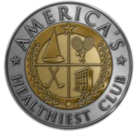
America's Healthiest Club – 3/4" Lapel Pin Item: "Lapel Pin"