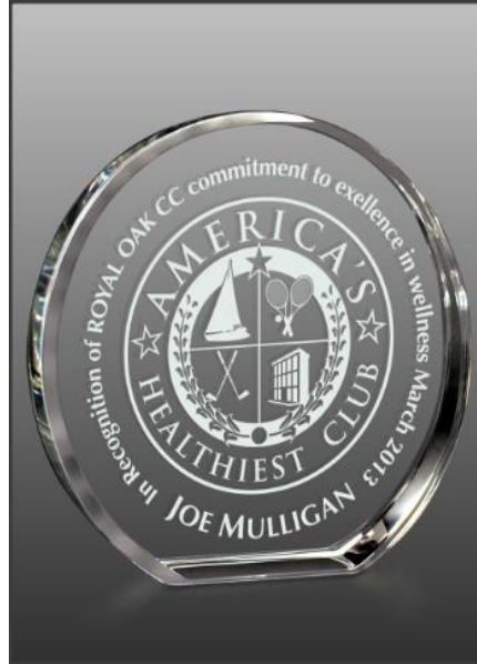
America's Healthiest Club – 6" Desktop Crystal Item: "Desktop" Price $199