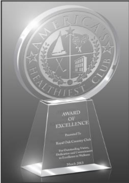
America's Healthiest Club – 10" Trophy Item: "Trophy - Small" Price $349